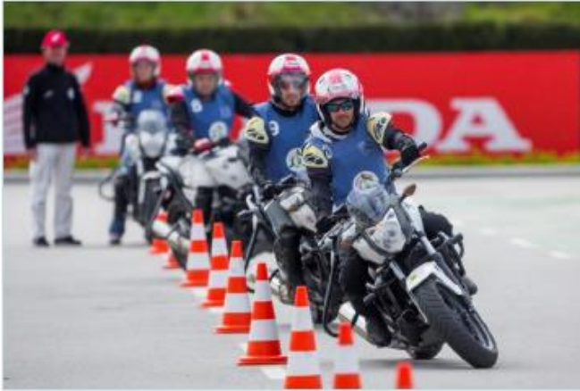
Agility-Slalom: 20 MIN