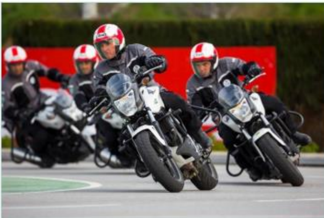
Cornering & engine brake: 20 MIN