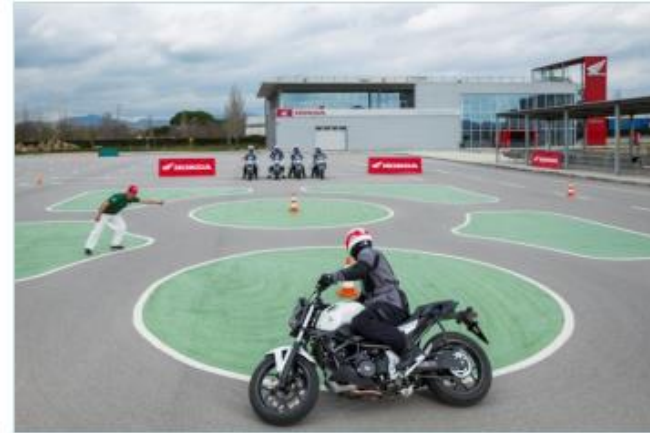
Cercles & "8s": 20 MIN